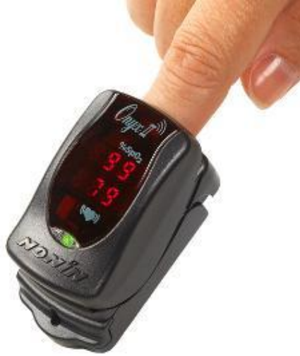
Picture 13AERO-901 Bluetooth pulse oximeter