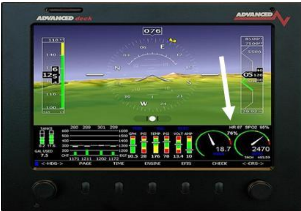
Picture 9 As seen on the Advanced Flight Systems