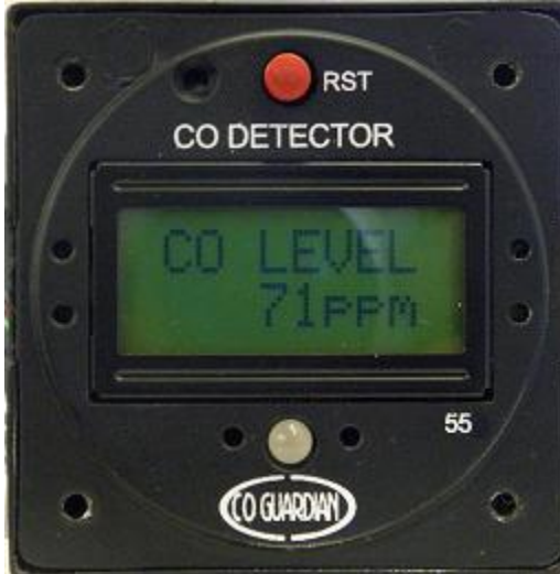
Picture 14 Aero 55 Displaying Carbon Monoxide level in parts per million (PPM).

And for the CO Level display please look at Picture 14.