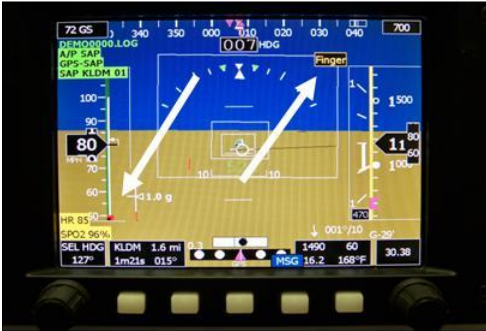
Picture 8 As seen on the Grand Rapids

The AERO-454 is also designed to display on the aircraft's MFD. The display page on the MFD depends on the MFD manufacturer. Please see pictures 8, 9 (for the SPO2 and Hearth rate data only), and 10 (for CO Level indication) for an example.