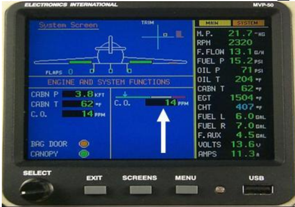
Picture 10 As seen on the MVP-50

When both the AERO-454 (Picture 1) and the AERO-55 (Picture 12) display are installed along with the 455 (Picture 11), place a finger in the AERO-455 (picture 11) and hold it for about 10 seconds, readings of the SPO2 (blood lever saturation percentage) and HR (hearth rate) will be displayed on the AERO-55 as shown on Picture 12 .