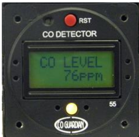
Picture 15 Amber alert light ON

If the AERO-454-201-001 is installed to display on the AERO-55-101-003 please refer to picture 15 to see how the AERO-55 will show the Amber light when the level concentration of CO in the cabin reaches above 50 PPM for more than 3 minutes. At the moment the amber alarm goes off, you will hear three short beeps every second. Use the “RST” button to shutoff the AUDIO alarm only. The amber light will go away until the CO concentration in the cabin disperses. Please look at paragraph 11 for more info.