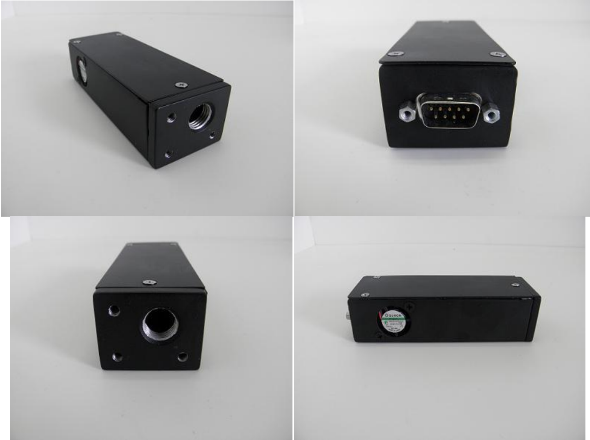
Picture 1 AERO – 454-201-001 CO DETECTOR