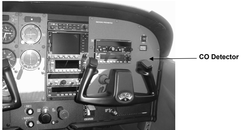
FIGURE 1 - TYPICAL RIGHT HAND INSTRUMENT PANEL SHOWN